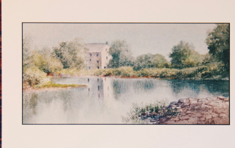
DeGaris Mill: 5 1/2" X 10 3/4" watercolor signed lower right, Hunleigh.